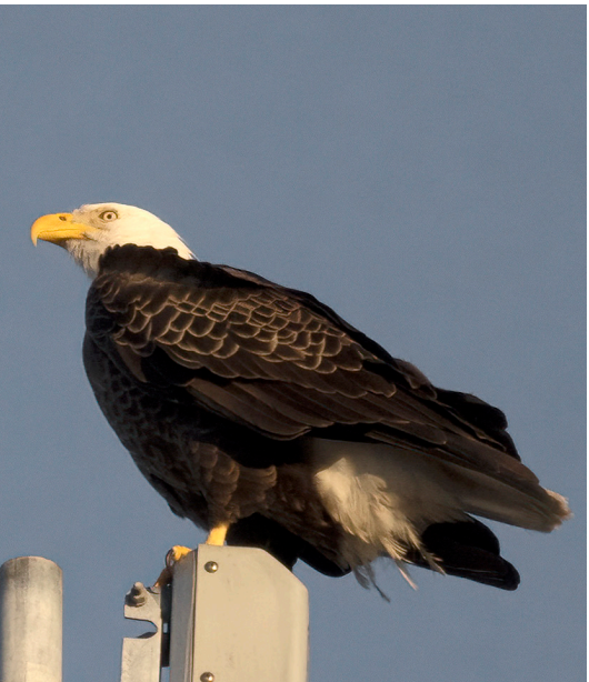
One of Oakleaf Village’s bald eagles hanging out on the cell tower on the corner of Klosterman and Disston.